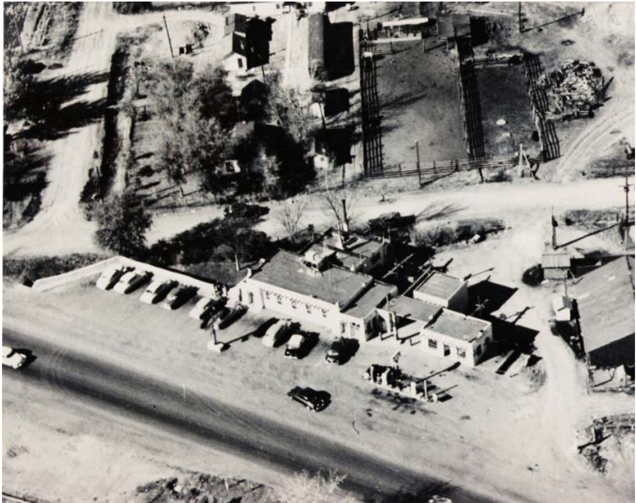
Pepper Pod Restaurant Aerial Image c 1948

By 1930 the Henrylyn Municipal Irrigation District was irrigating 34,617 acres of southeast Weld County with water from the South Platte River. This helped to transform Hudson into a successful farming and agricultural community.